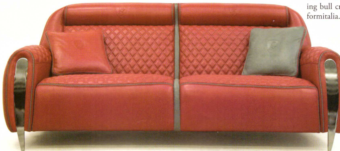
Formentera Lux Sofa by Tonino Lamborghini Casa

Mechanical stylistic elements - bearings, connecting rods, pistons, exhaust pipes, ventilation grilles, headlights, leaf springs and hinges adorn upholstered chairs, desks, lamps and beds made by Formitalia for Tonino Lamborghini stamped with the raging bull crest. For more, check out www.formitalia.it