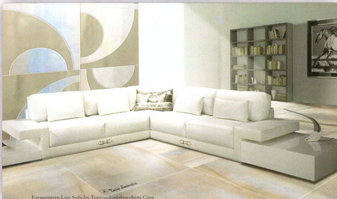
Formentera Lux Sofa by Tonino Lamborghini Casa

To complement the quilted leather upholstery of sofas, chairs and beds, Tonino Lamborghini has partnered with GS Luxury Group to launch a line of smart tiles.