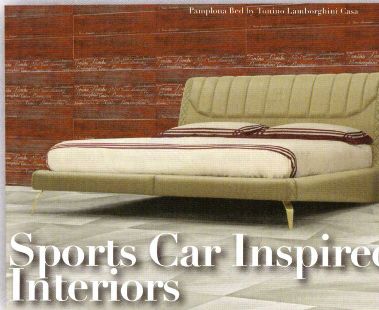
Pamplona Bed by Tonino Lamborghini Casa

Hot girlfriend: check! Sexy sports car: check! Hmm...how to furnish your living space to match your trophy-collecting lifestyle. Tonino Lamborghini Casa translates the iconic sports car into a branded concept for total living.